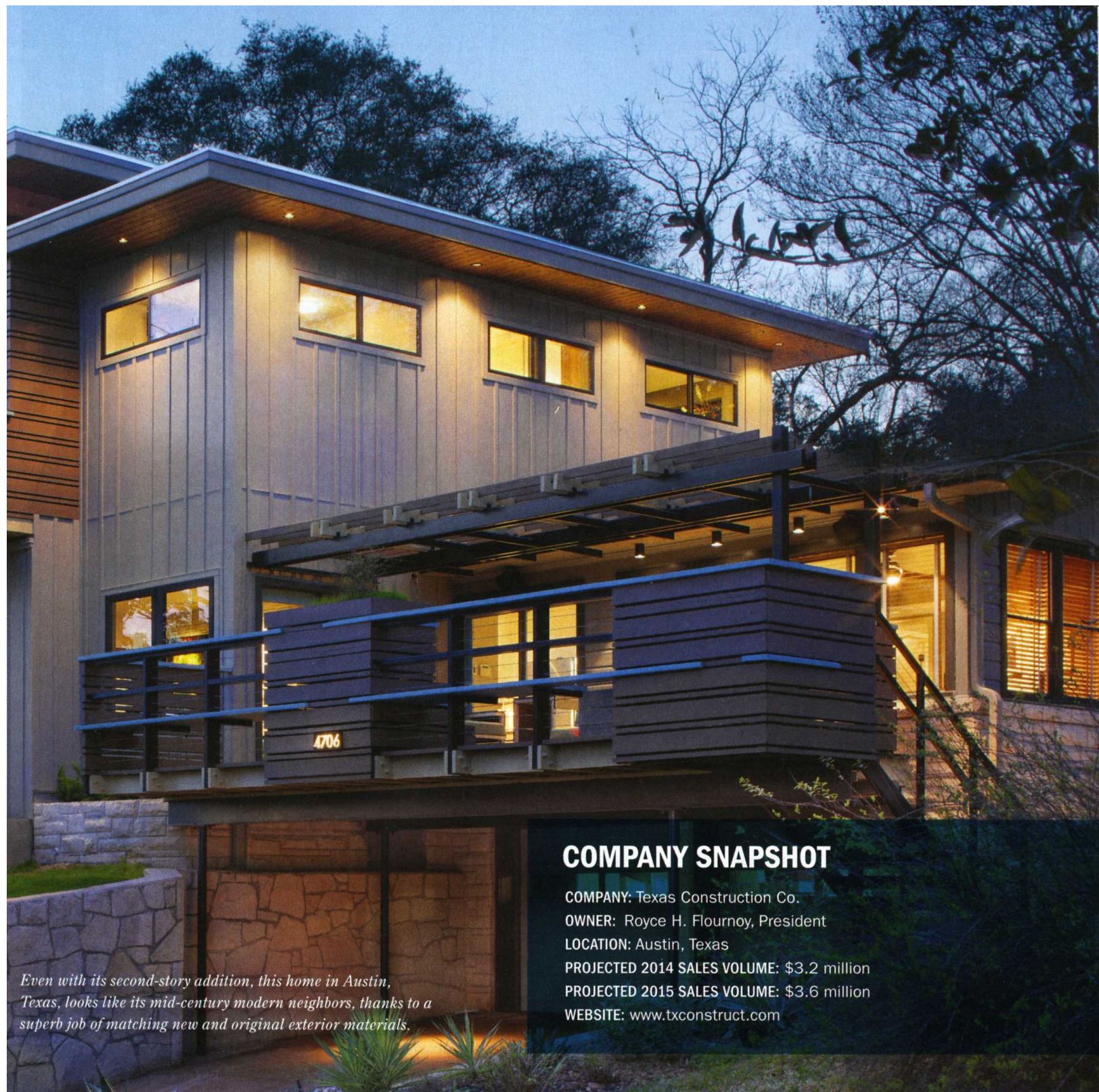
Even with its second-story addition, this home in Austin, Texas, looks like its mid-century modern neighbors, thanks to a superb job of matching new and original exterior materials.