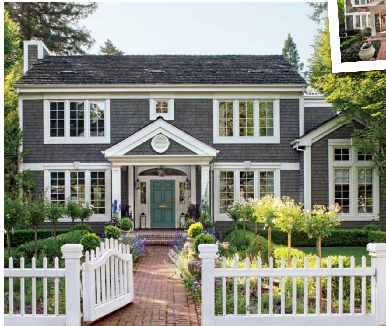
LEFT: The handsome house lacked a garden frame (BEFORE); now, sturdy shrubs form the backbone of an English-cottage-style garden.