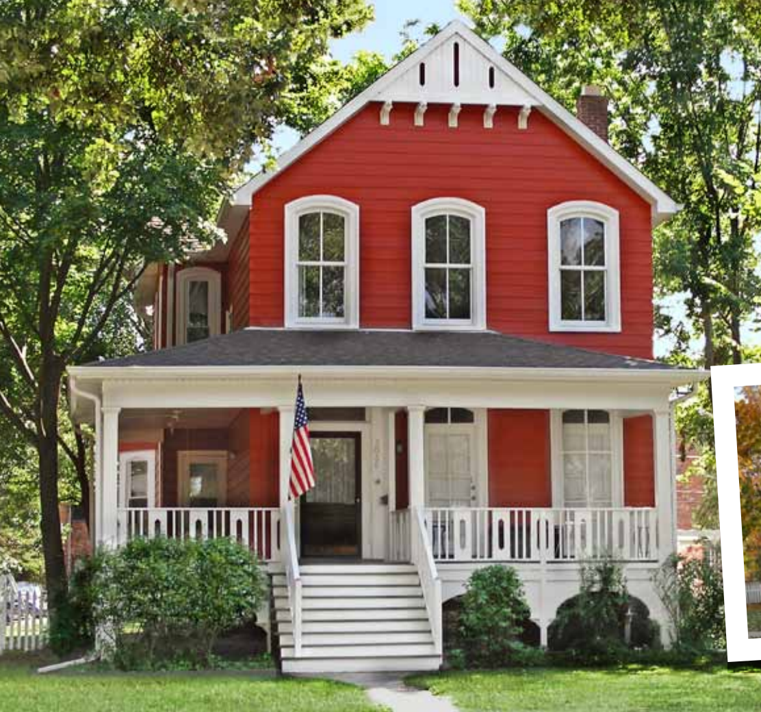
LEFT: A revived front porch adds a sense of spaciousness and ample streetside charm to what had been a rundown rental (BEFORE).