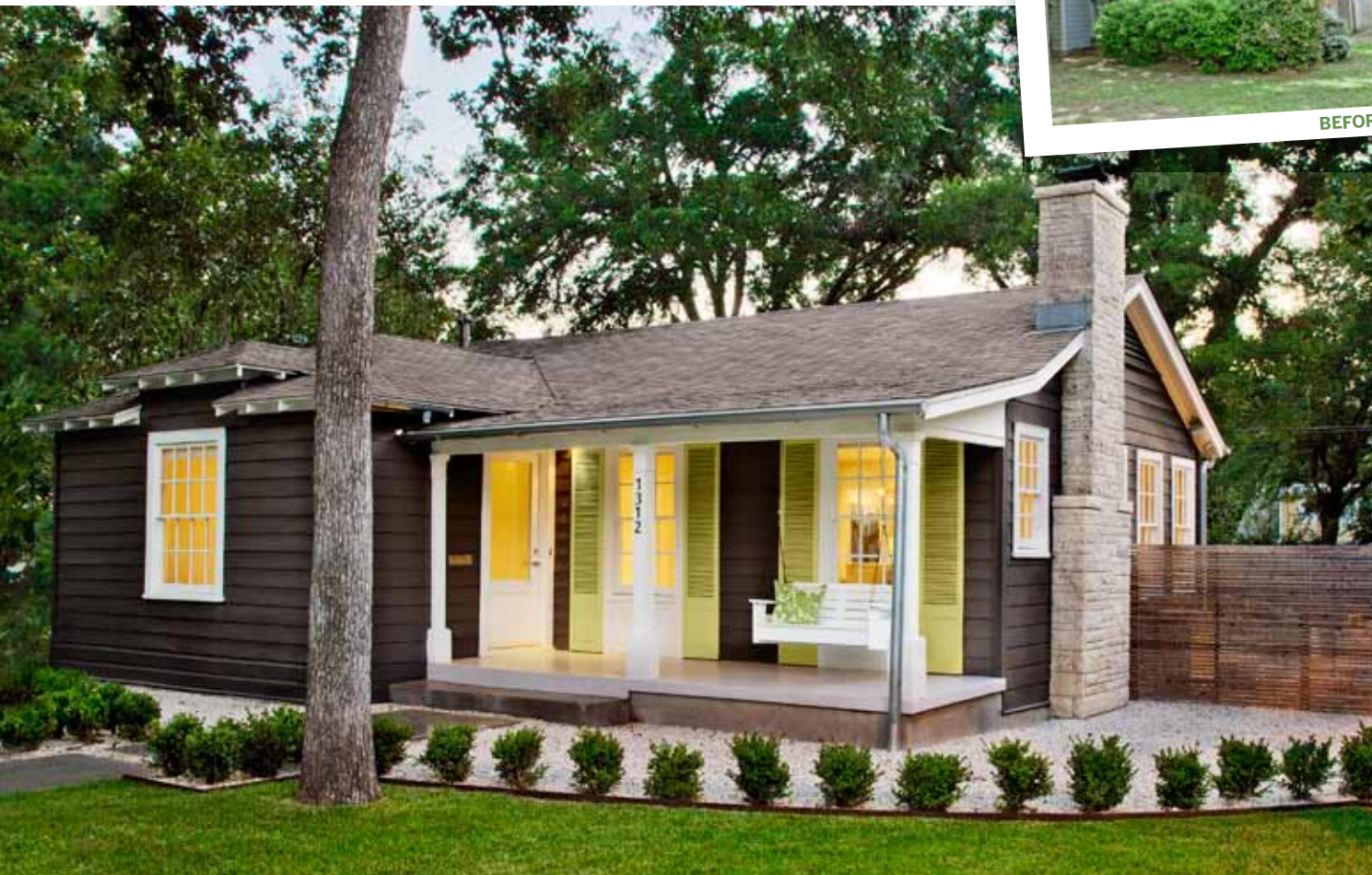
PHOTOS: COURTESY OF TEXAS CONSTRUCTION COMPANY; (OPPOSITE PAGE) COURTESY OF BENNETT FRANK MCCARTHY ARCHITECTS