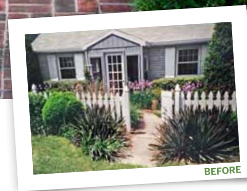
ABOVE: Removing a picket fence (BEFORE) opened up the front yard to a densely planted symmetrical garden with a pair of weeping cherry trees.